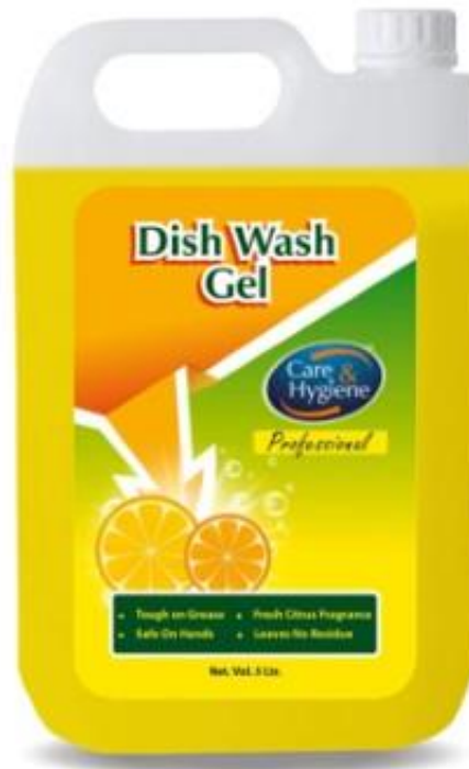
▪ Dish Wash Gel