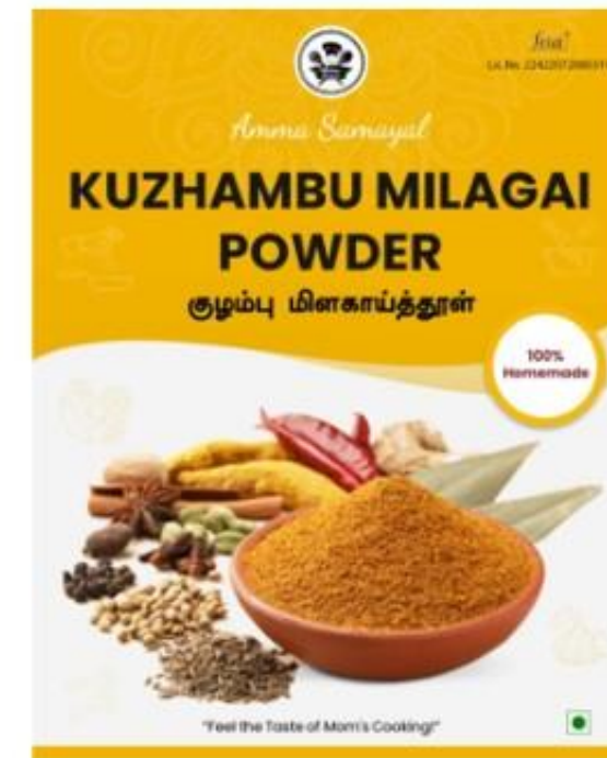
▪ Kulambu Masala