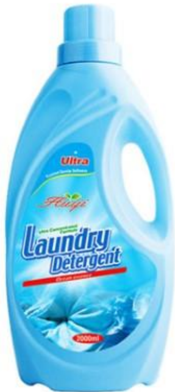
▪ Washing Liquid