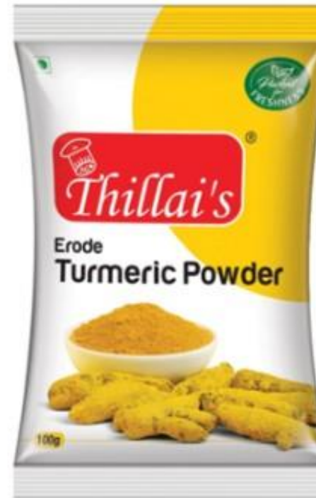
▪ Haldi Powder