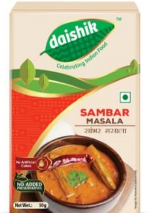
▪ Sambar Masala