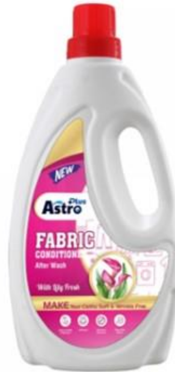
▪ After Wash Fragrance